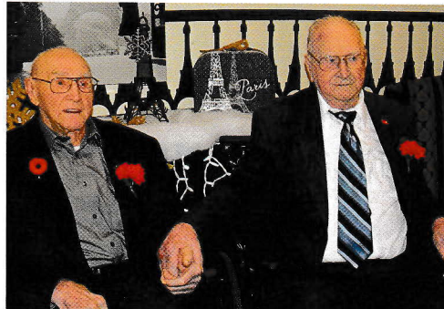
Enjoying the Gala Night