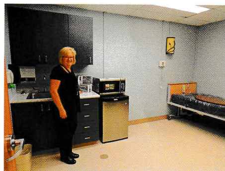
Showing off, the almost completed, Compassionate Care Unit

The new iPad is a hit! The residents have been able to connect with distant family and share face to face time.