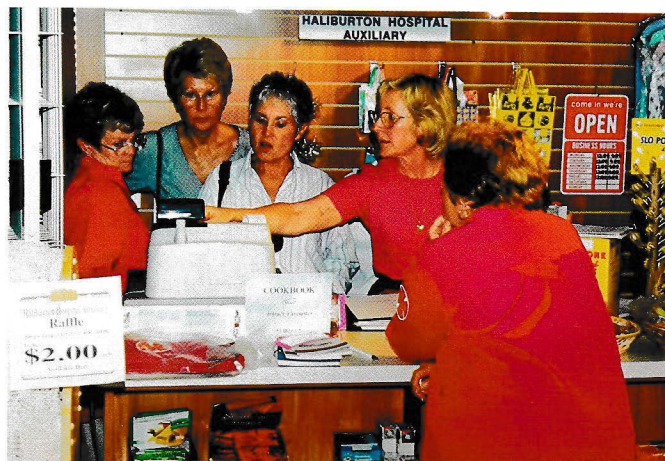
Pay attention Ladies! This is important! It's not brain surgery! Learning the cash register