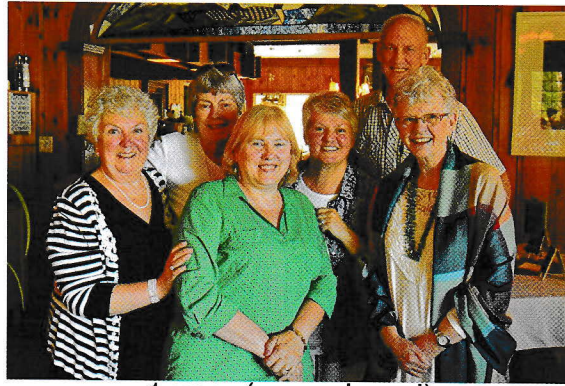
1 year (a good one!)