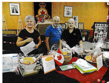
Silent auction set up