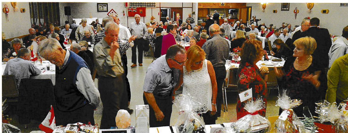
Once again...a sold out event