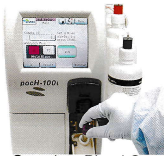
Complete Blood Count Analyzer