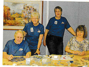
Counting the record take!