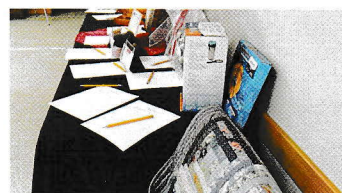
Waiting for bids