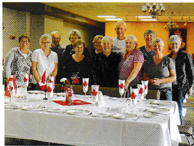
The amazing team